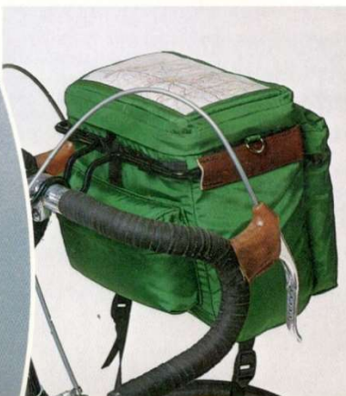
Vagabond #9 Handlebar Bag*†