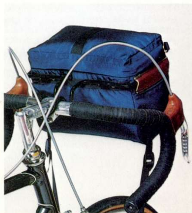
Vagabond #3 Handlebar Bag*†